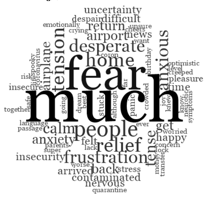
Figure 1 - Memorable emotions of the interviewees

sadness, and paranoia, appeared in several descriptions, especially those related to the experiences lived in lockdown, flight cancellations, difficulties in customer service, uncertainties about the possibility of contamination, and return home situations. Expressions like "getting stuck", "I just wanted to go home" appeared in many narratives, always at touching moments of the interview, when participants remembered the stress and fear of being away from home, surrounded by uncertainty. Some reports of nervousness, due to the Covid-19, appeared yet in the pre-trip.